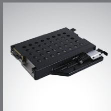
Multimedia Bay 2 nd Storage